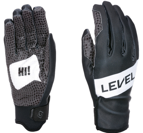
18 black grey