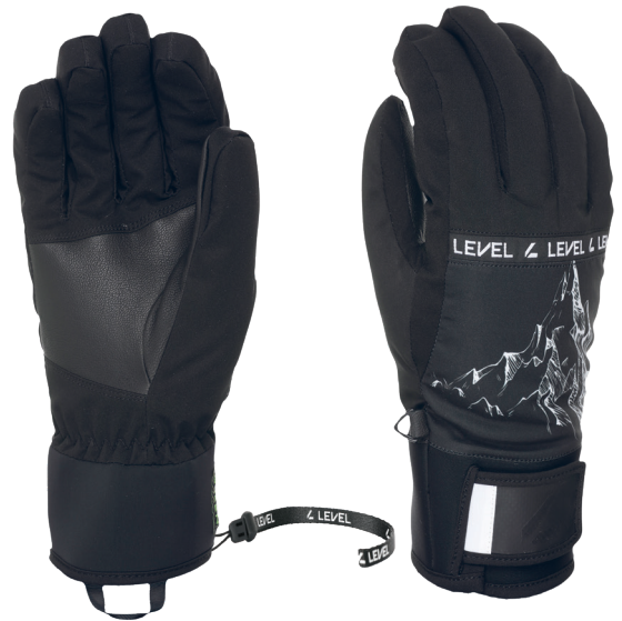
43 pk black