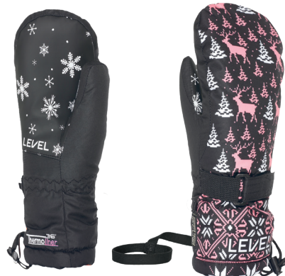
68 ninja pink