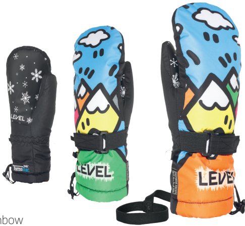
39 pk rainbow