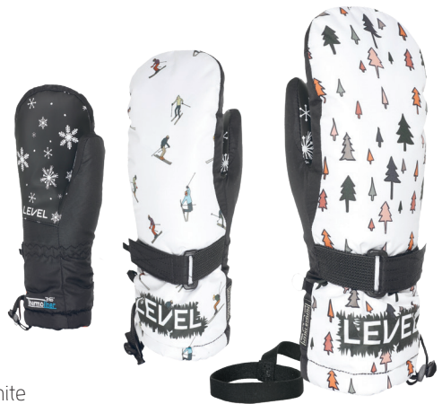
40 pk white