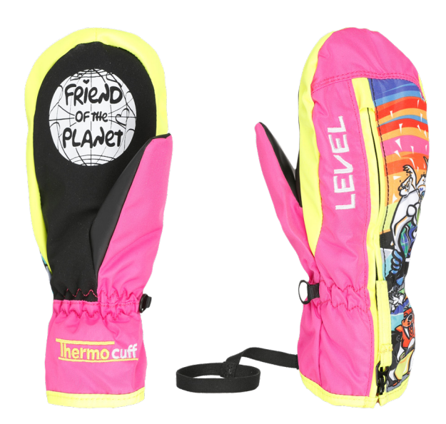
<u>SCREEN PRINT DETAILS</u> Sleek screen print pattern on palm.