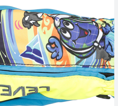
FLEECE CUFF INSIDE

Convenient fleece cuff with velcro closure that facilitates the entry of the child's hand in a very practical way