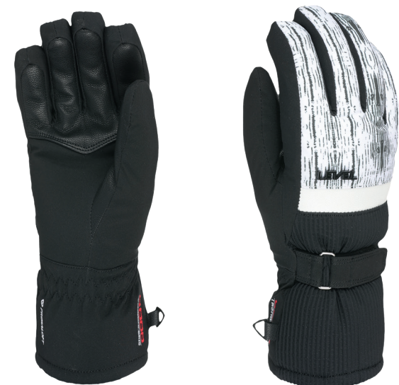
41 ninja black