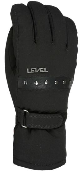
43 pk black