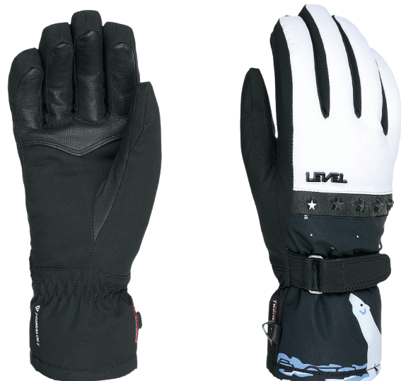
35 black white

DRY TECHNOLOGY: Membra-Therm Plus FEATURES: Cuff with fur inside, Storm leash, Adjustable strap